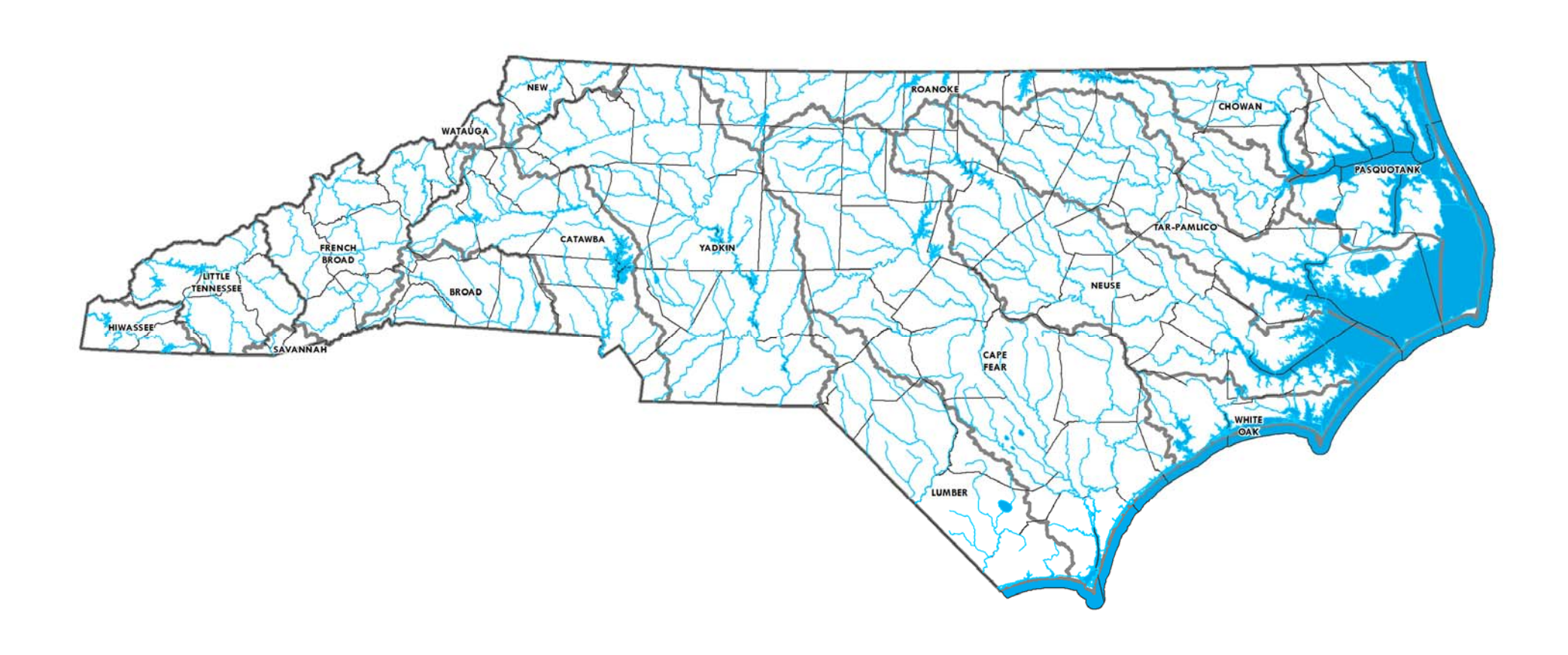
Exhibit 1: Major Rivers, Lakes, and Coastal Waters of North Carolina

Source: Program Evaluation Division and Information Systems Division