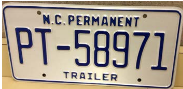
Permanent plate issued for private trailer subject to annual registration fees