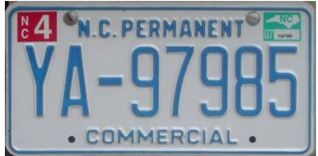
Permanent plate issued to commercial vehicle subject to annual registration fees