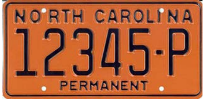
Orange and black permanent license plate currently issued to non-state entities