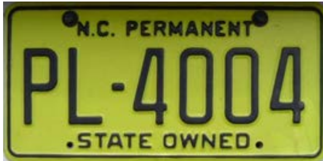
Permanent license plate issued to state agencies and institutions