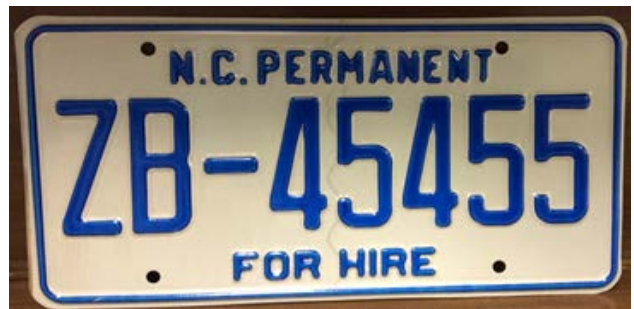
Permanent plate issued to for-hire vehicle subject to annual registration fees