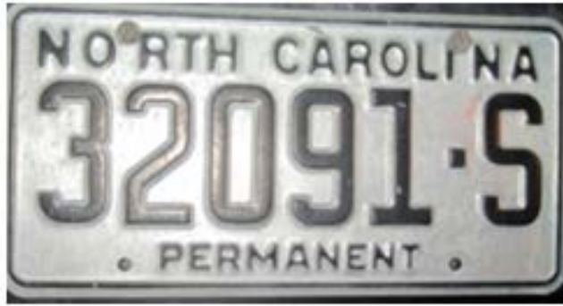
Silver and black permanent license plate issued to non-state entities prior to December 31, 2012